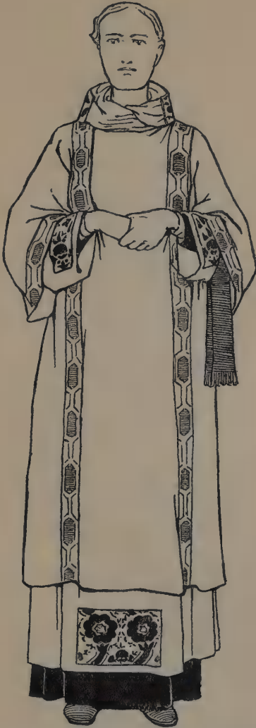
SUBDEACON IN CASSOCK, AMICE, ALB, GIRDLE, MANIPLE, AND TUNICLE.